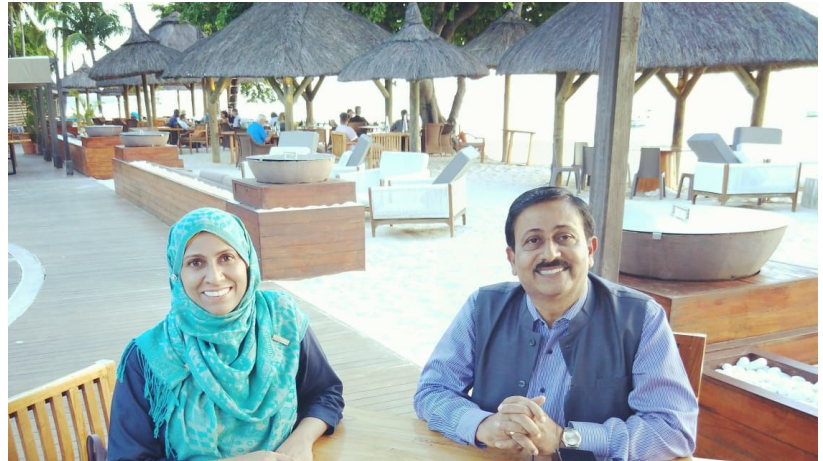
Photo taken at At Hilton Mauritius during our Dynamics of Capital Mechanism Program in May 2019